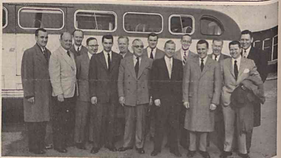
SALESMEN VISIT MILLS —Members of our Sales organization who toured the mills December 9 as a part of the annual sales meeting held at Hotel Roanoke in Roanoke, Va., are shown above. Not all of the salesmen came to the mills since many of them remained in Roanoke in preparation for the Fieldcrest distributors meeting which was held immediately following the sales meeting.