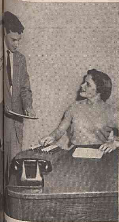
RECORDS —Wastemeter reports show amount of waste on each job in comparison with standard allowances. Wastemeter gives dollars and cents to waste so that money loss is indicated.