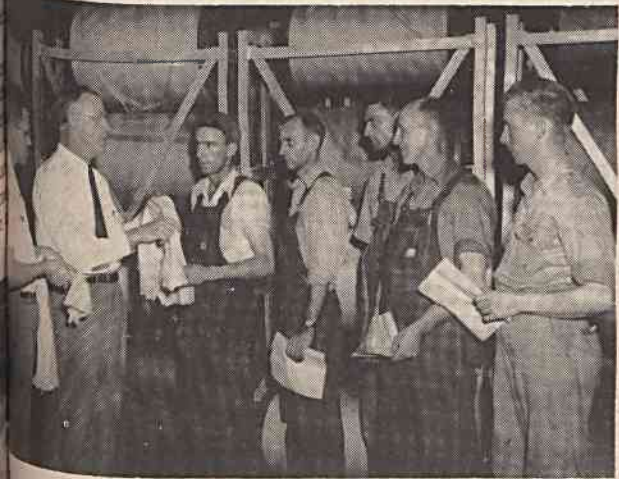
ANOTHER MEETING employees receive reports on suggestions that have been made. At this point specific control measures are adopted and put into effect.