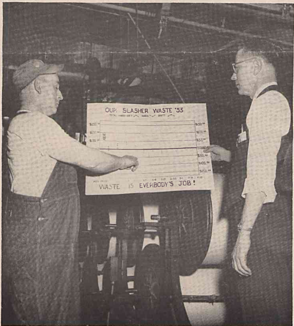
CHARTS POSTED IN DEPARTMENT SHOW RESULTS OBTAINED.