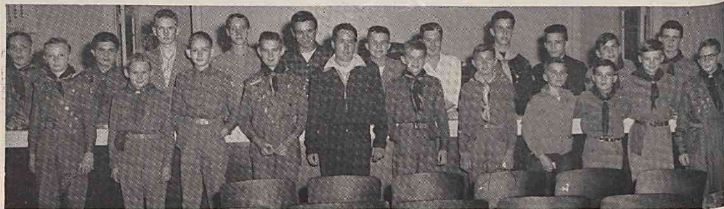
Boy Scouts of Dan River District at the Court of Honor, March 10, in the Recorder's Court Room

From baker to buyer in three generations of American women—that's the story told in a recent survey made by Tip-Top Bakers. Today's homemakers buy about 90 per cent of their bread, whereas their grandmothers made about 90 per cent of the breadstuffs their families ate.