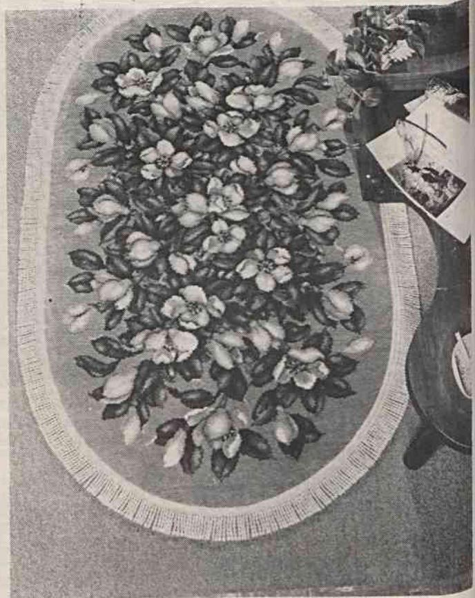
OVAL Accent rug, in traditional design, has been introduced. Pattern No. 628 (green background) is shown above.