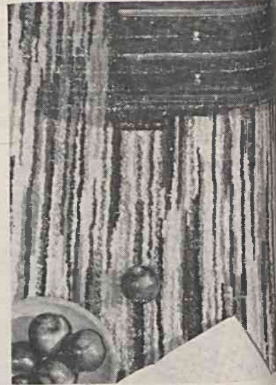
"RAGTIME" textured cotton broadloom rug, ideal for provincial or ranch interiors.. In 9' and

Dixie Clay, a rich warm terra cotta new colors and has been added to textured wool) and Chateau (washable selections. In the Chateau toned neutral, has been added to the line.