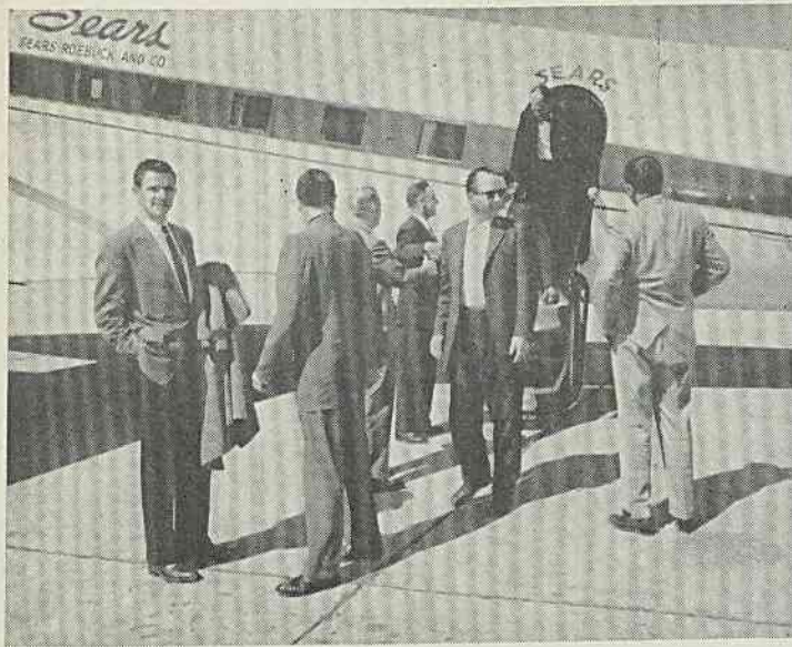
Sales officials and domestics section managers from Sears, Roebuck and Co. leave plane on their way to visit Fieldcrest.