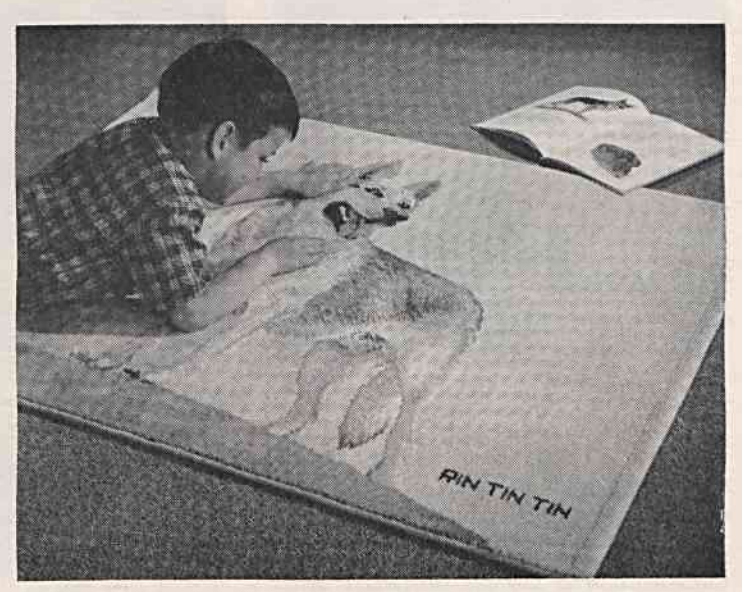
Rin-Tin-Tin rug will delight the youngsters as well as nostalgic parents who used to follow Rinty's adventures at Saturday night movies instead of on television.