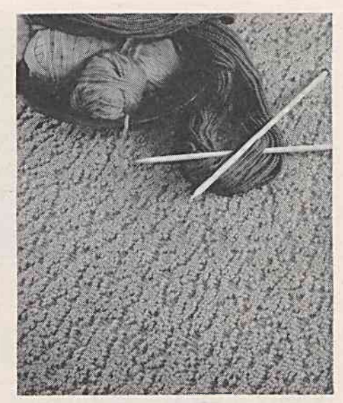
Flourish, new loop-pile carpet introduced at the Chicago Market, is made in eight colors including two blended colorations.