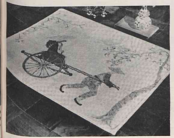
In new Rickshaw rug in Happiness Group, natural colors of cherry blossoms and Japanese figures blend into background cream and pale gray with blue Mount Fujiyama.

New Happiness rugs, which appear below, are Rickshaw, showing a Japanese girl riding among cherry blossoms with Mount Fujiyama in background, in soft pinks, blues and mauves, and Rin-Tin-Tin, in gray and cream tones, so skillfully designed that it becomes a distinguished portrait of the famous movie and television dog star.