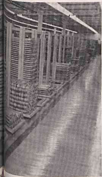
Good zoning and proper storage racks are kept lined up within aisle vehicles.

its place, is an old and summed up in the word housekeeping program.