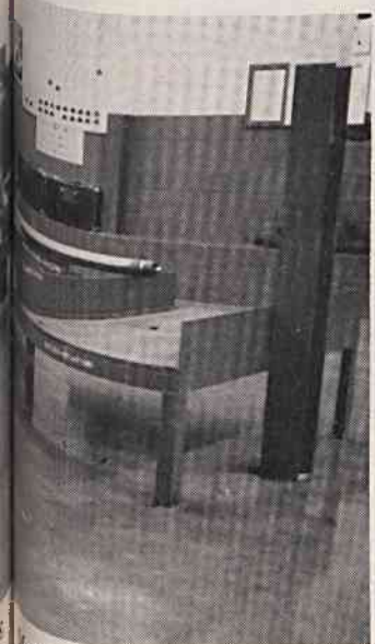
Left, storage bench in machine shop at Blanket Mill shows orderly arrangement for parts brought for repair and parts to be picked up after repair.

Various ways to store boxes, and show the results of improved housekeeping at