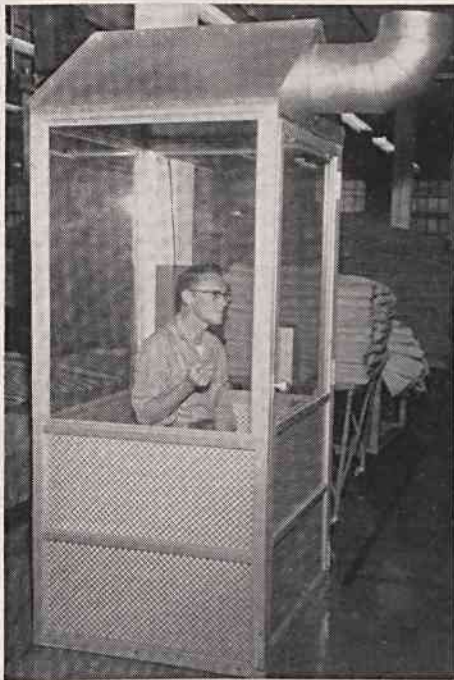
Above, smoking booth area at Bedspread Finishing Mill is clean and well-kept. Smoking booths are provided at all mills for convenience of employees.