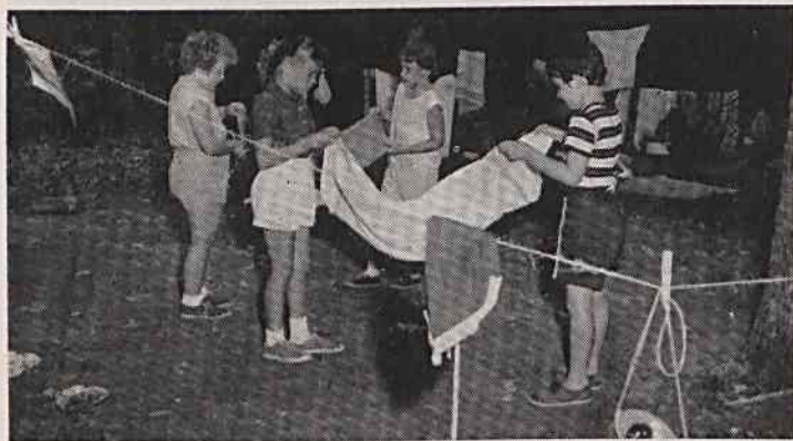
Brownies were responsible for care of their unit campsites.