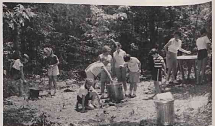
Brownies help prepare a meal for visiting adult leaders.