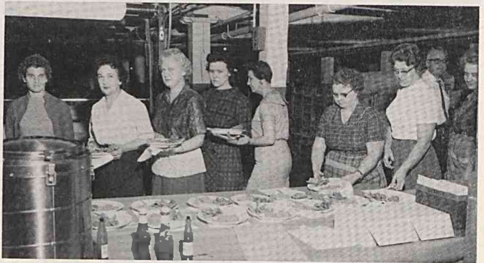
Members of Inspecting Department pick up barbecue plates at serving table.

Under terms of a safety contest sponsored by the company, a barbecue is given all employees of any mill which meets the requirements for a state safety award.