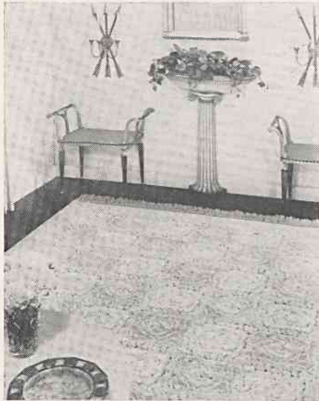
The "Alexei" rug, a dense, velvety cut pile wool, is available in eight sizes and in 12 Grecian inspired colorings.

Other important introductions by Karastan include "Le Sandeau", a real