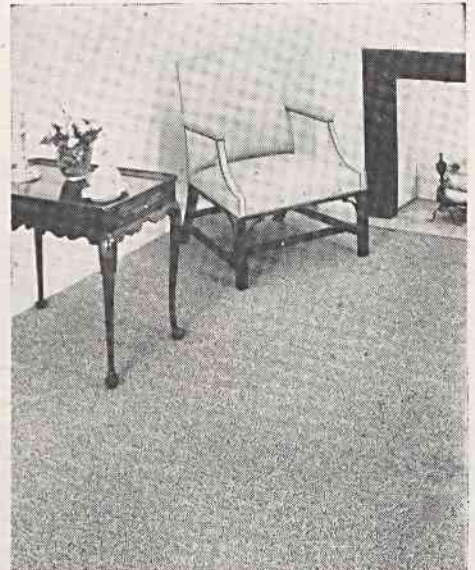
Versatile "Trienneau", a multi-color frieze available in 12 colorings, lends itself to many periods of furnishings.

luxury broadloom with a high cut, low loop effect; and "Marceau" hand carved rugs made of 100 per cent acrylic fiber. "Marceau" rugs will display 10 individualistic carvings and dozens more may be ordered. The seven sizes range from 3 x 5 to 12 x 24, with a choice of 18 exacting shades.