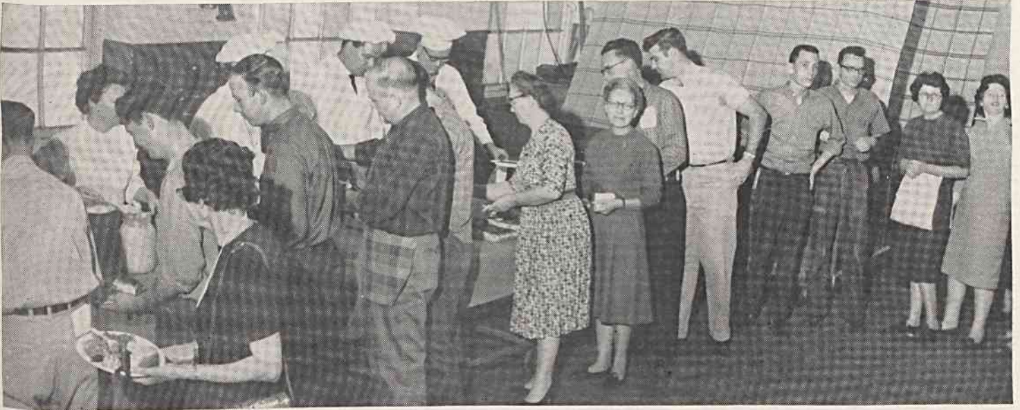
In Sewing Department, a group of employees of the Bedspread Finishing Mill are served barbecue dinners in recogni-

tion of their fine safety record in 1962 when mill operated entire year without a lost-time injury.