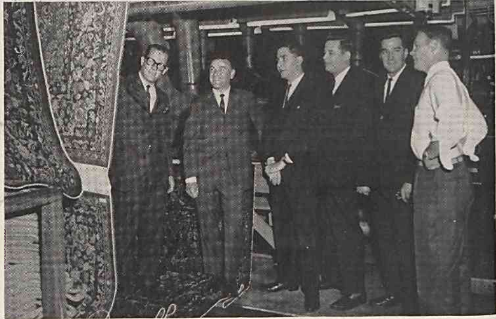
Visiting customers observe a shearing operation during tour of Karastan Mill.

The Karastan Mill was host recently to the rug salesmen from B. Gertz, Inc., a Karastan customer in Jamaica, L. I., N. Y.