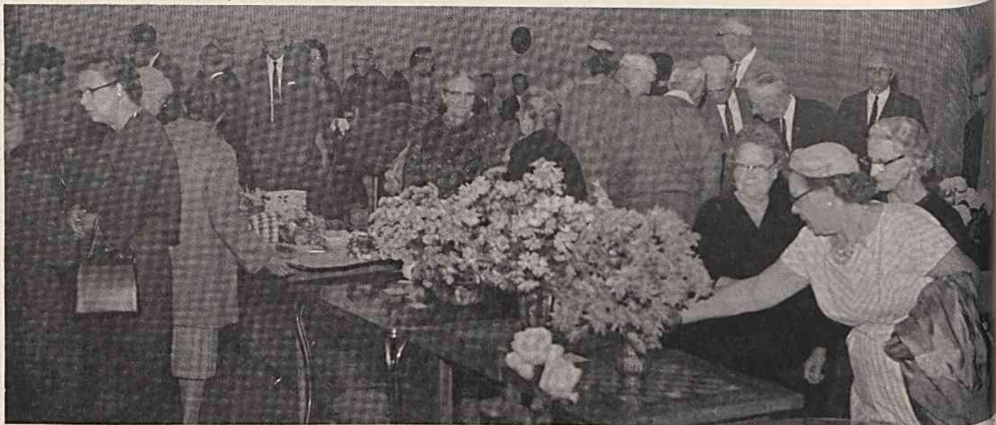
Members of the Y.M.C.A. Golden Age Club are shown during the annual hobby and garden show at Consolidated Central Y.M.C.A.