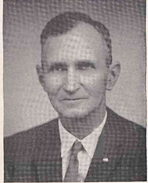
HERBERT R. SHELTON