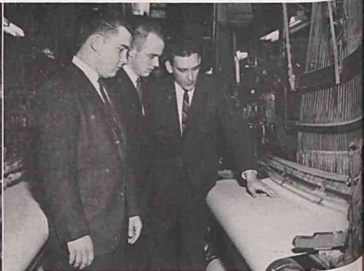
Visiting supervisors from the Automatic Blanket Plant in Smithfield are shown during their tour of the Blanket Mill at Draper.