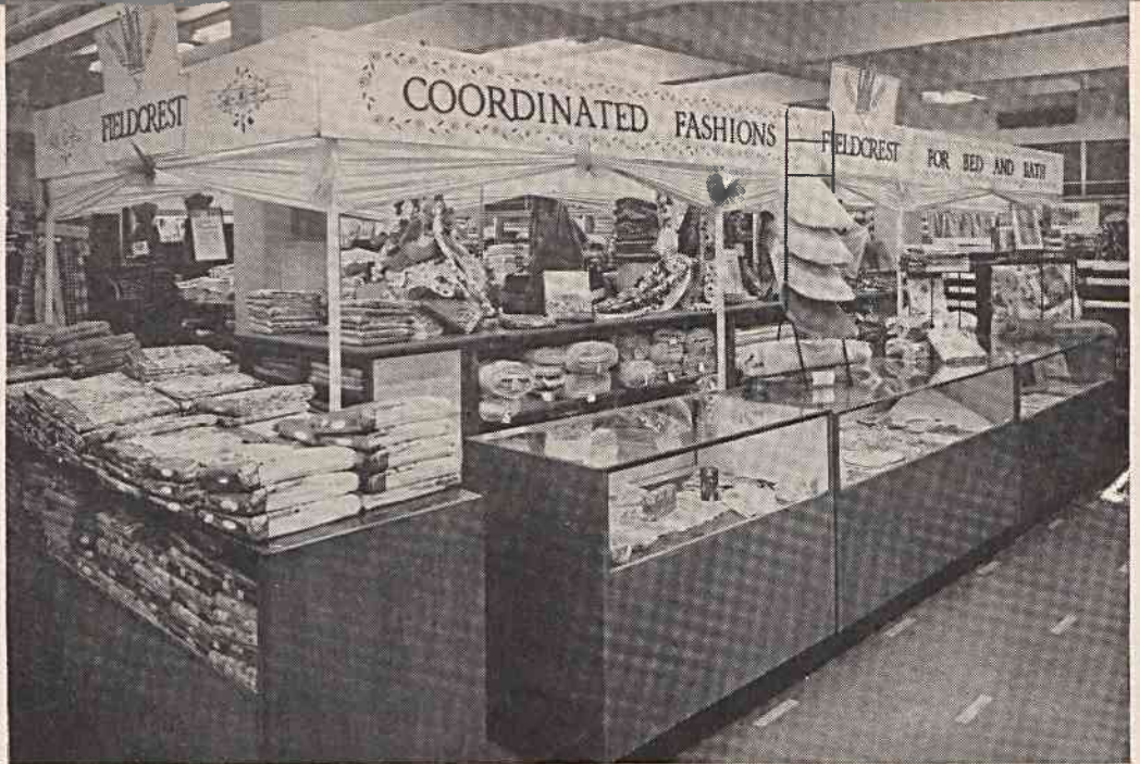
Canopy in domestics department emphasizes Fieldcrest's coordination idea.