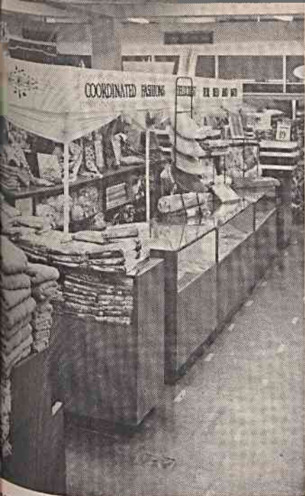
...ence given Fieldcrest merchandise.