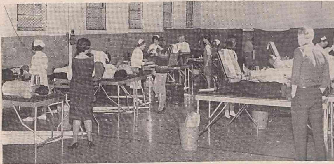
Tables were kept filled as donors came in steady stream during the entire afternoon.