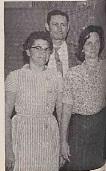
THE MILL WHISTLE