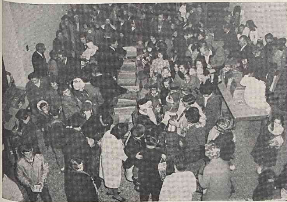
CHILDREN GET TREATS — A part of the large crowd that attended the company-sponsored children's Christmas party in the Tri-City area is shown as treats were distributed following the program. Santa Claus is shown in center foreground. Similar parties were held at other plant locations. See page seven for more children's party pictures.