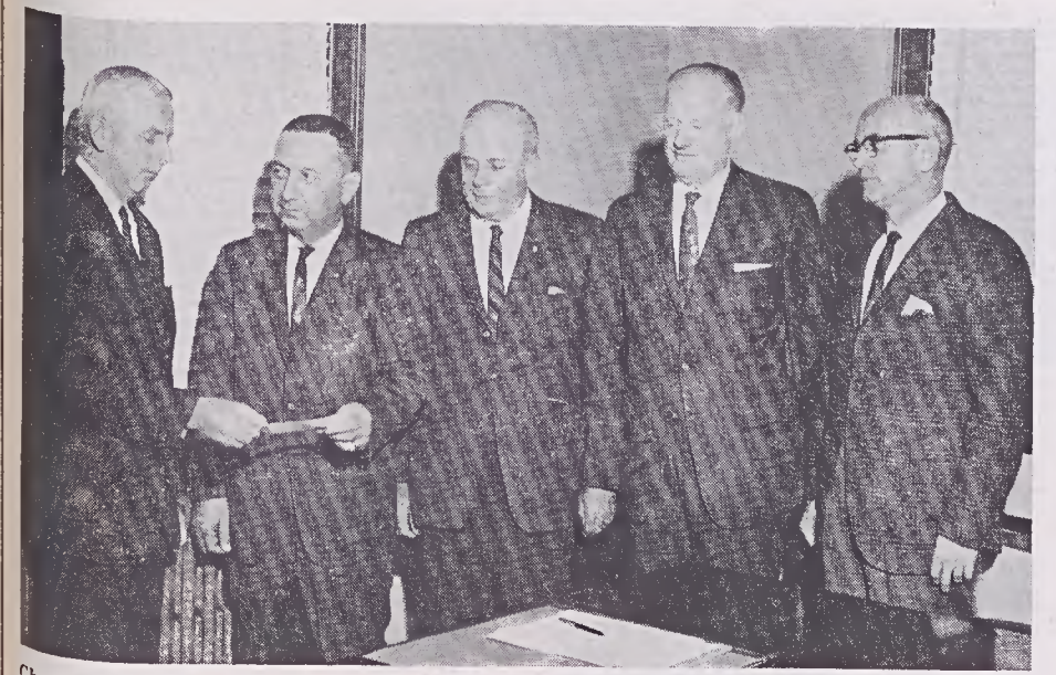
Check is presented for purchase of football seats at Fieldale-Collinsville High School.