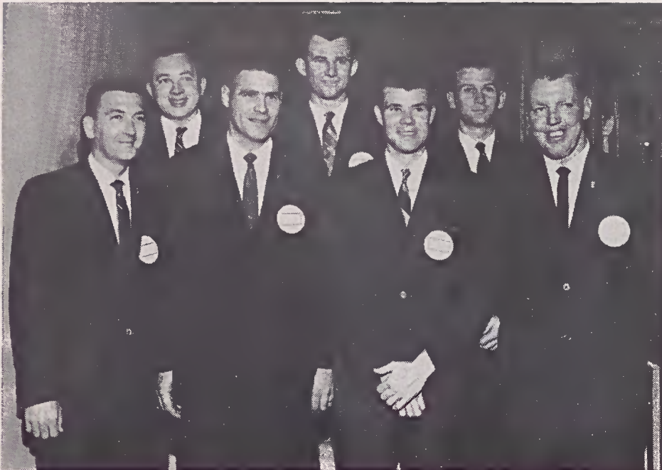
New officers and directors of Tri-City Jaycees, installed at recent meeting.