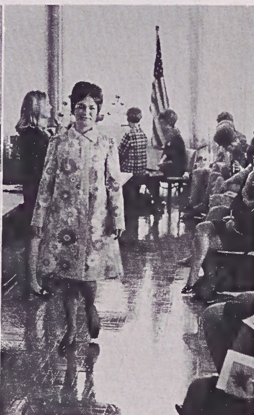
Raincoat is from "Felicity" shower curtain, with lining from "Perfection" sheet.