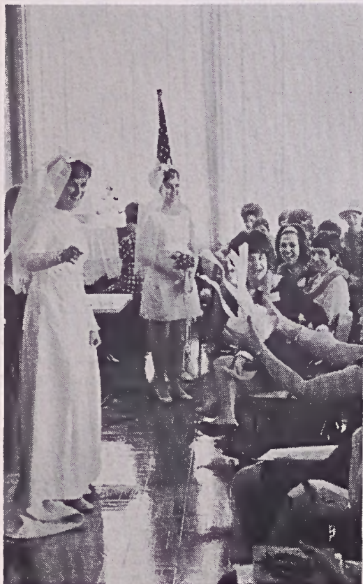
Bridal gown and bridal mini are made from "1776" matelasse bedspread.