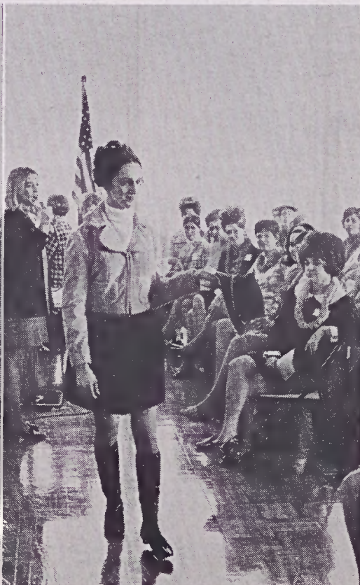
Skirt and jacket from "Lustre" towels; hat fashioned from Fieldcrest washcloths.