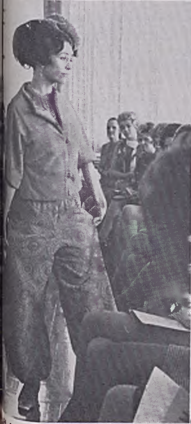
has pants made from "Samar" towels. Top is of "Lustre" towels.