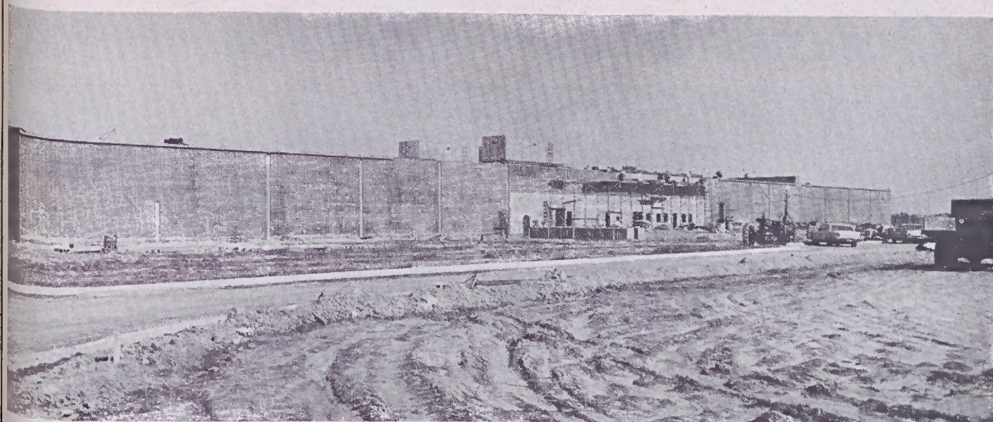
New Fieldcrest plant being built at Greenville will contain complete equipment for manufacturing yarn on worsted system.