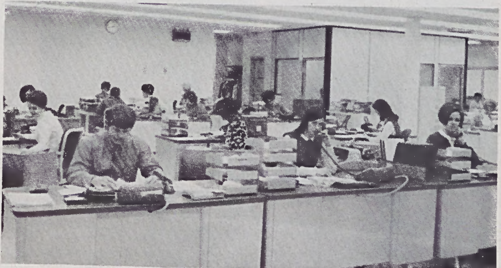
Laurelerest's Karastan Account Correspondent section, Inventory Control, and Claims.