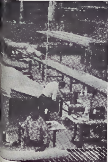
Department in background.