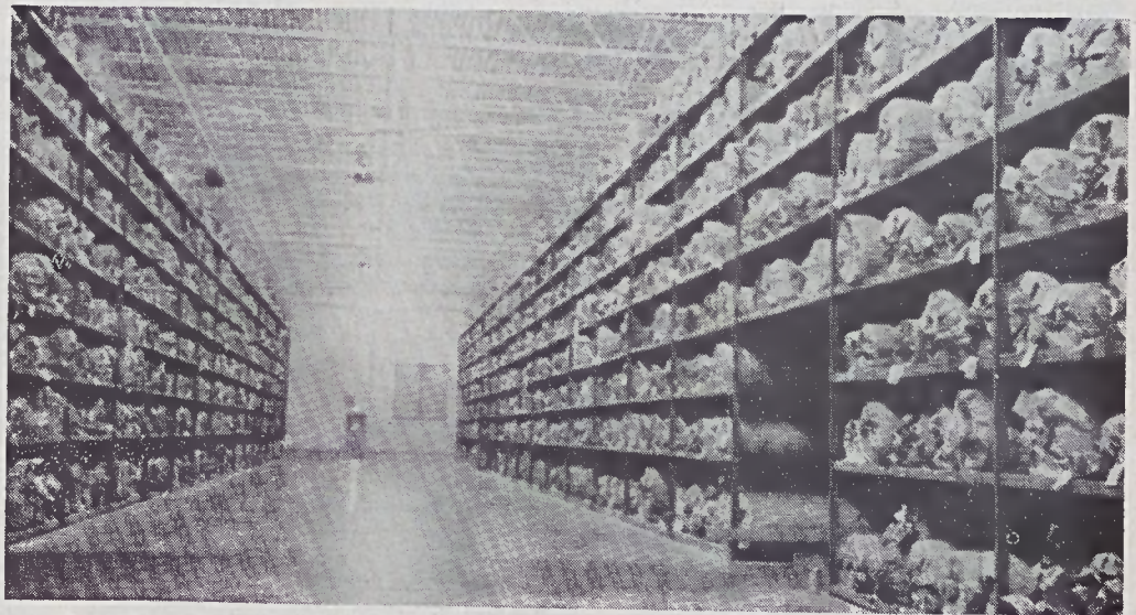
A section of warehouse where rolls of finished carpet are stored prior to shipment.