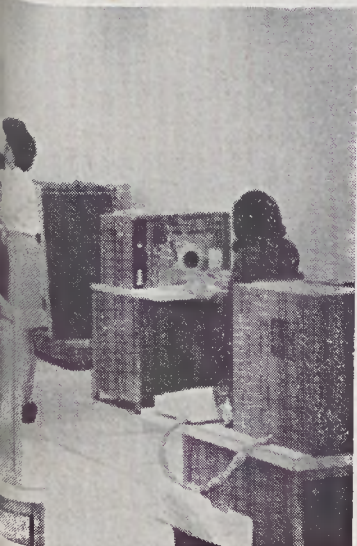
Karastan Information Services.