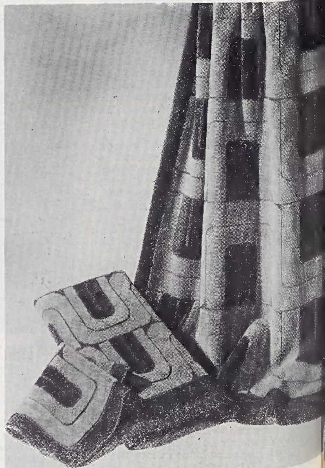
"Vis A Vis"