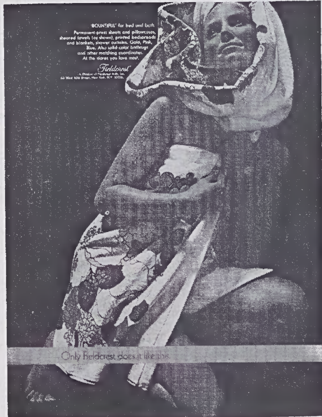
Ad illustration shown above features "Bountiful", Fieldcrest's new One-Look for Fall, 1970.