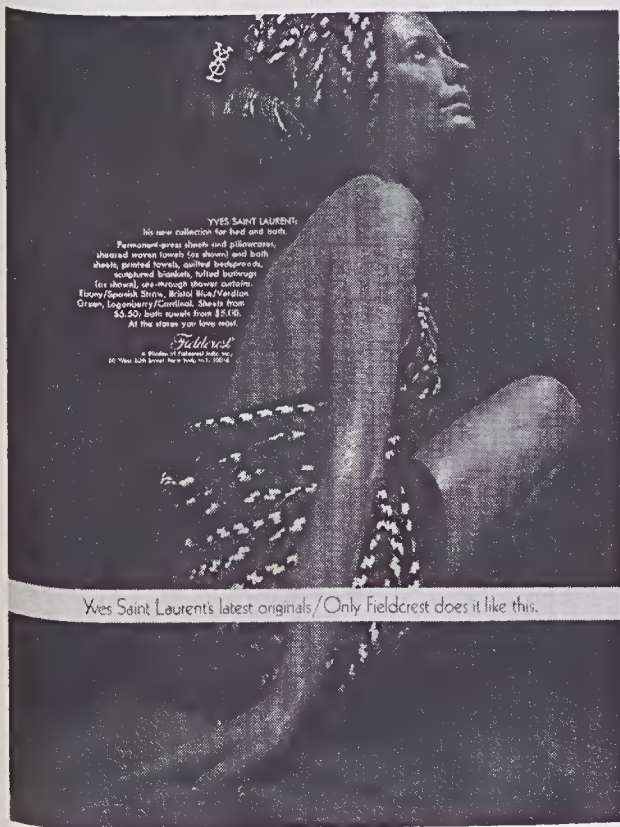
Yves Saint Laurent-designed "Desert Song" ensemble coordinated with rug is shown in the ad above.