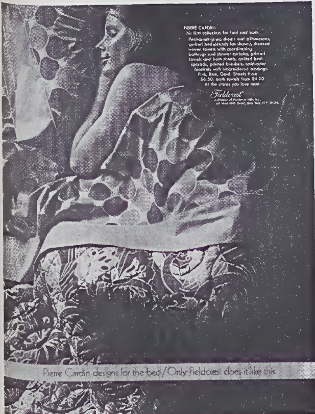
Pierre Cardin's "Ronde" sheet and pillow cases are coordinated with his "Floriale" bedspread.