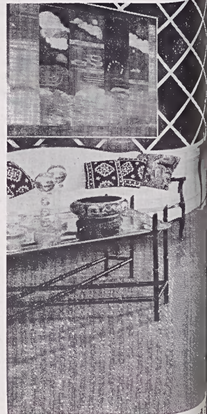
"Fortuneau" is an elegant textured surface composed of a mixture of space-dyed filament nylon yarns combined with skein-dyed staple yarns.