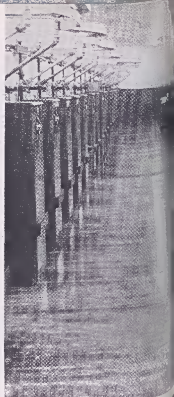
In the Spinning Department polyethylene covers are free from lint.