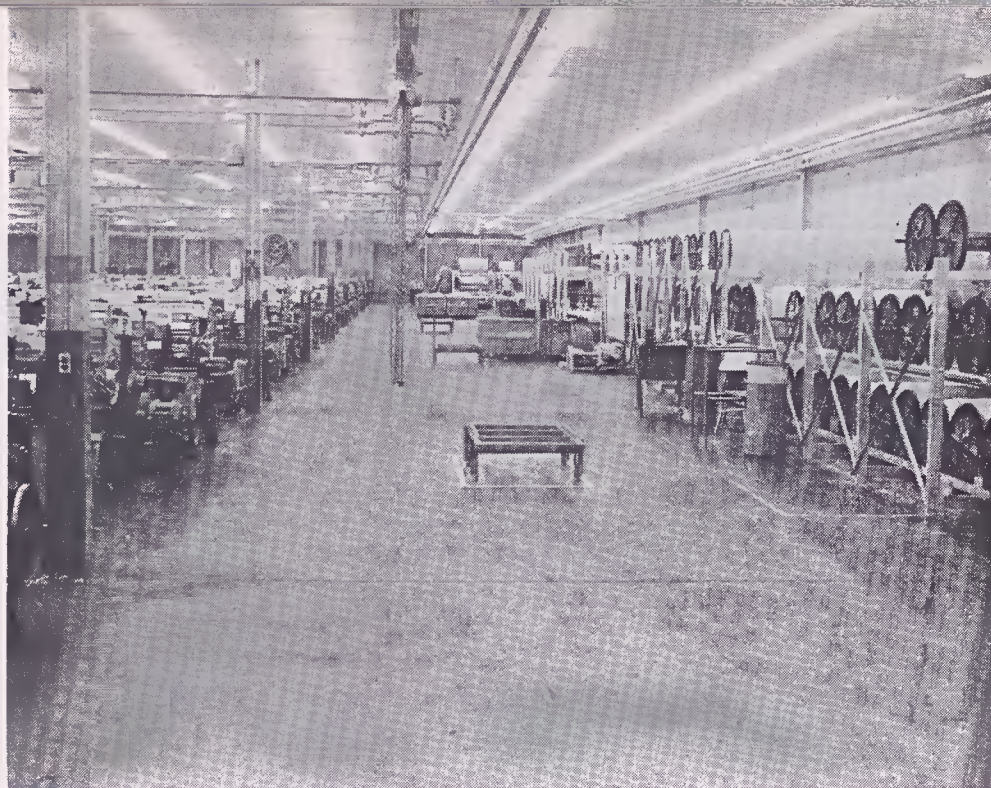
This is a view in the beam storage area in the Weave Room at the Alexander Sheeting Mill. Properly zoned areas contribute to good mill housekeeping. Barrels, boxes and other equipment are kept in designated locations.