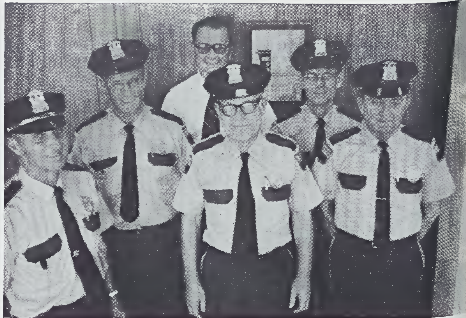
Burns security force at Smithfield took first aid certification course.