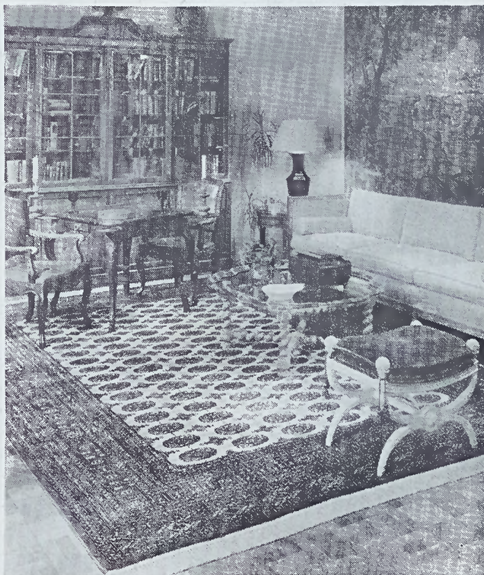
Ivory Bokhara Oriental design has stylized octagons and intricate borders, ground of ivory and wine-red border.