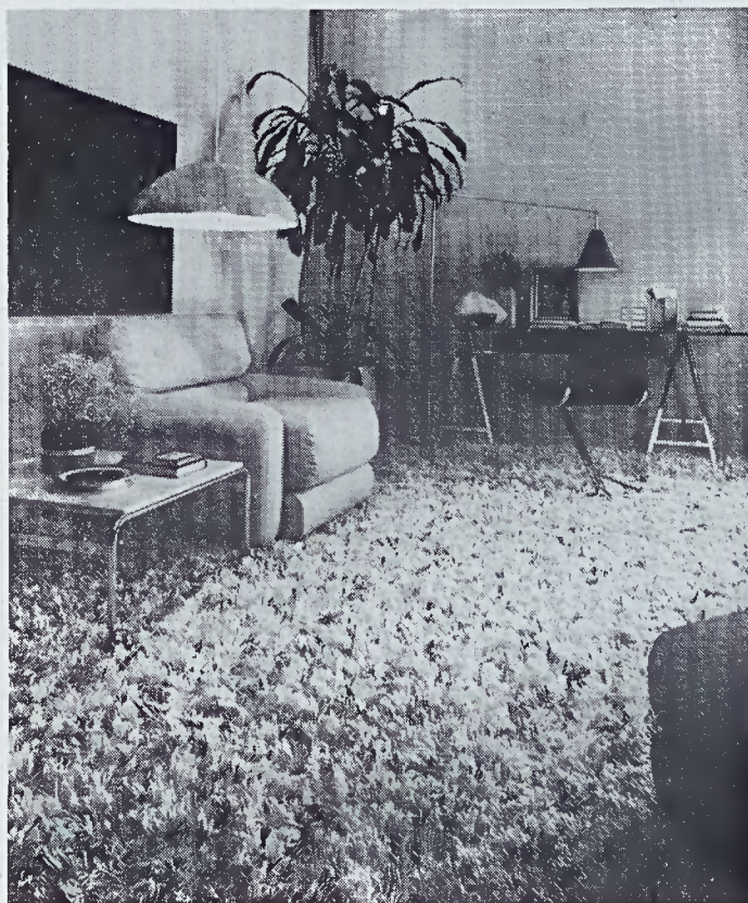
New wool shag, "Jubilation", features random flecks of accent colors on solid ground. Available in 16 colorations.