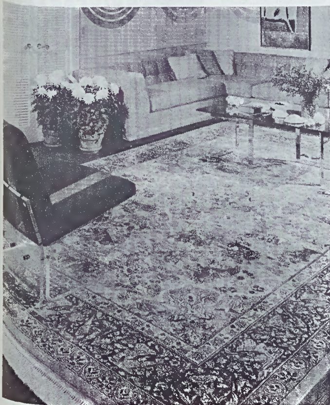
Karastan's new Oriental design, "Persian Hunting", is re-creation of 16th century silk hunting rug.