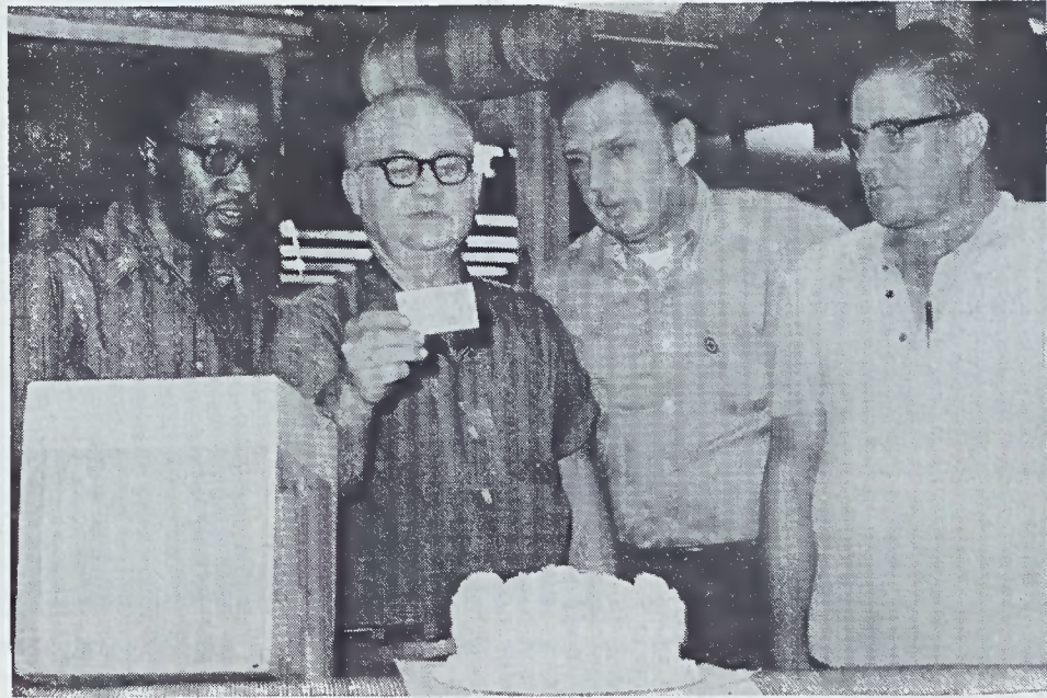
Members of Karastan Safety Committee conduct drawing for cake.