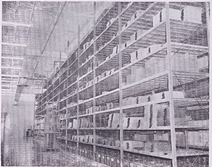
In Sample Department, note orderly storage of carpet samples. Floors are clean and well-kept, surrounding areas orderly.