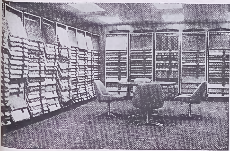
In display room in AMP Building at Eden, samples of rugs and carpets are on display to aid employees in making their selections.