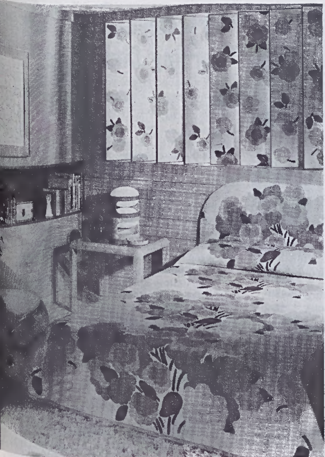
Marimekko's "Morning" collection has bold color range.