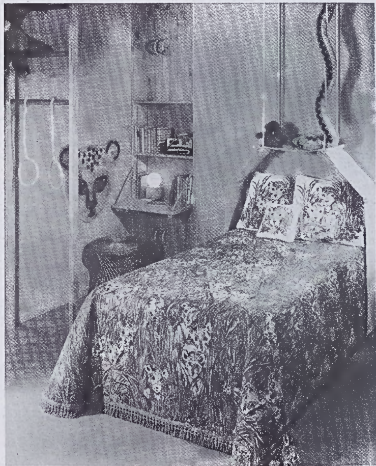
Elsa's cubs peer from foliage in "Living Free" collection.