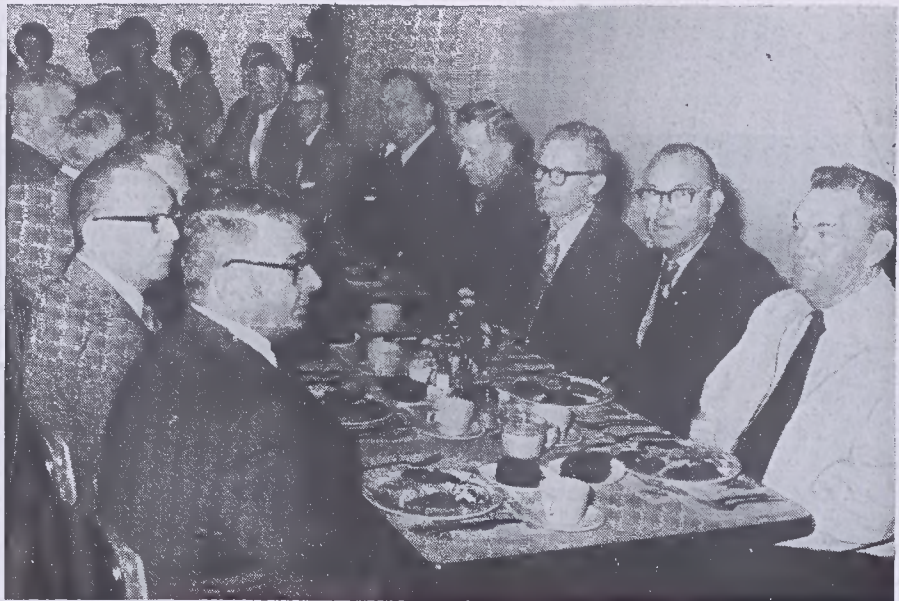
Luncheon in school cafeteria followed program.