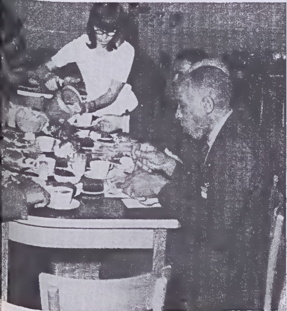
Enjoying a good meal.