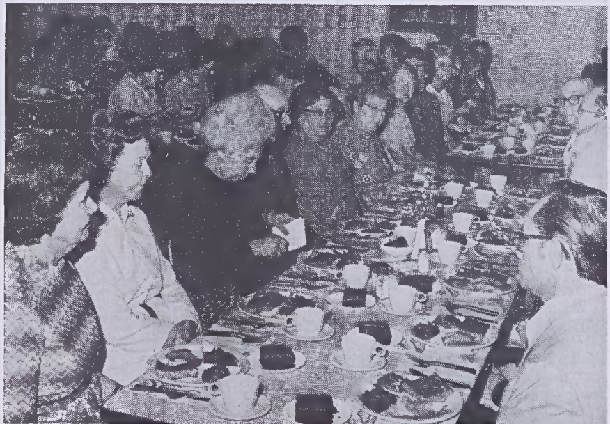
Discussing the day's program.