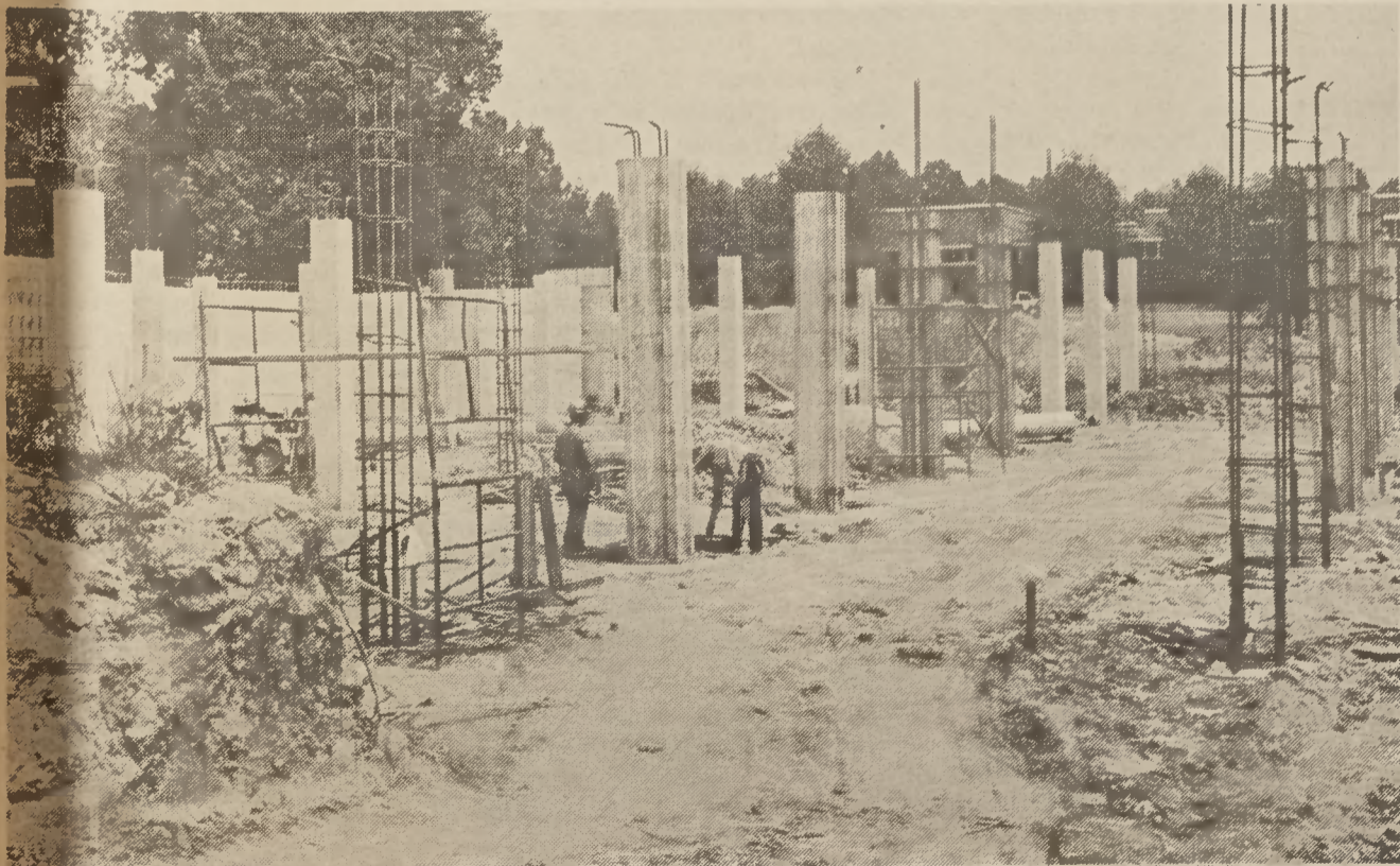
The new Fieldcrest Technical Center is expected to be completed by the end of April, 1974. Shown are the lower level columns which are constructed of concrete with reinforced steel inside.