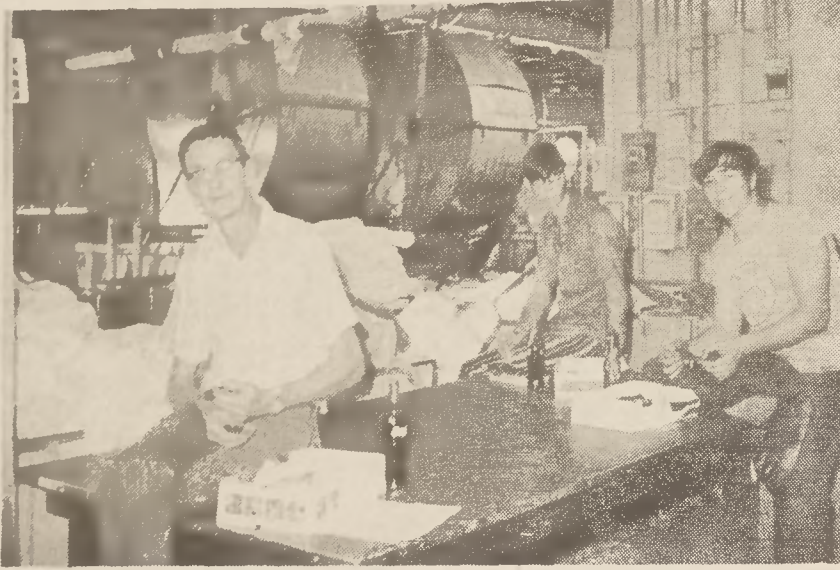
Employees in the Laundry Department enjoy barbecue.

Under the terms of the safety award barbecue contest which began in 1957, any mill is entitled to a barbecue when employees have achieved 2,000 man-hours per employee without a lost-time accident.