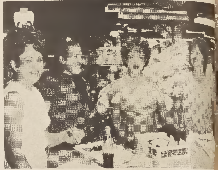
Table Top Tufting employees shown at barbecue.