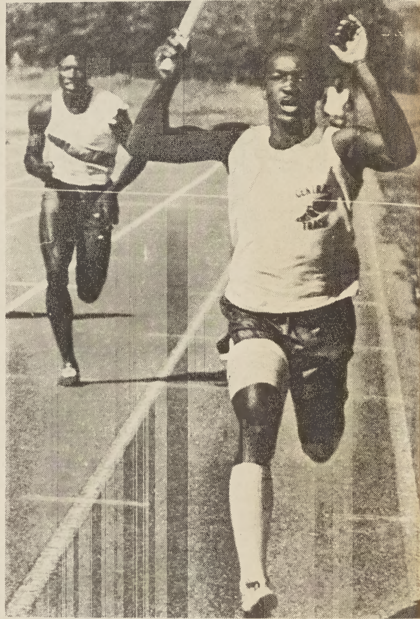
HARVEY GLANCE . . . champion athlete