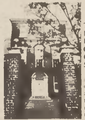
The Nathaniel Russell House Circa 1809 Charleston, South Carolina

This historic home hosts a guest appearance by Karastan...with a present day collection perfect for an American mood. Treasures from the Orient were prized in those early days, as you will prize Karastan Oriental design rugs today. And the graciousness of that era is captured in broadlooms and rugs inspired by designs from our nation's past. Power-loomed and superbly crafted of pure wool, each bears the Woolmark...your assurance that luxurious beauty, glorious color and unsurpassed quality will endure long into the future.