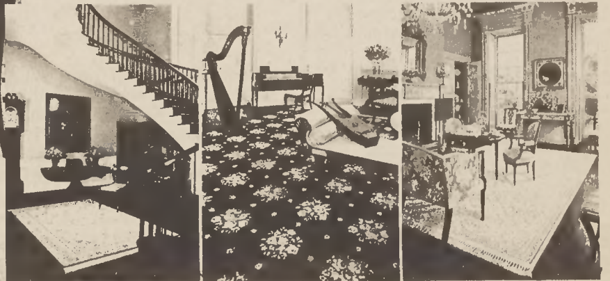
The splendor of Karastan's Chinese-Medallion Oriental design rug provides a beautiful country pair to a dramatic flying saucer. Woven of pure worsted wool and lustre-washed to an antique finish.

A proud example of post-Colonial architecture, the house is now open to the public.