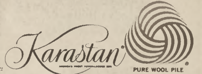
Karastan translates the beauty of a damask pattern into sumptuous "Empress" broadloom. Karastan weaves of pure wool yarns for an unmatched feeling of opulence. Available in 19 skein-dyed colors.