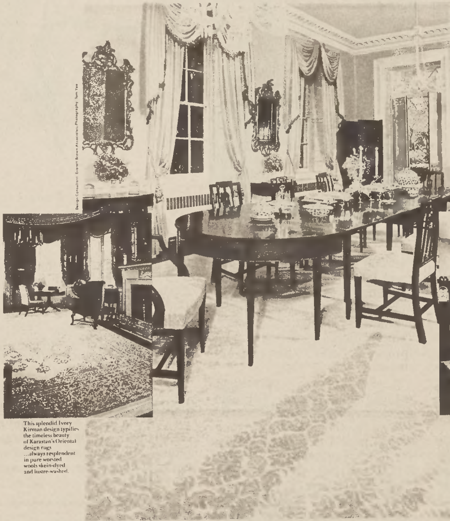
This splendid Ivory Kirman design typifies the timeless beauty of Karastan's Oriental design rug... always resplendent in pure worsted wool, skein-dyed and lustre-washed.