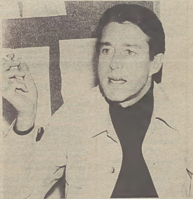
HALSTON, noted designer of women's clothing.

The Sears "Symbol of Excellence" award was won by Fieldcrest's bedspread operation for four consecutive years, 1967-1970. The award this year is the first for the Fieldale Towel Mill.