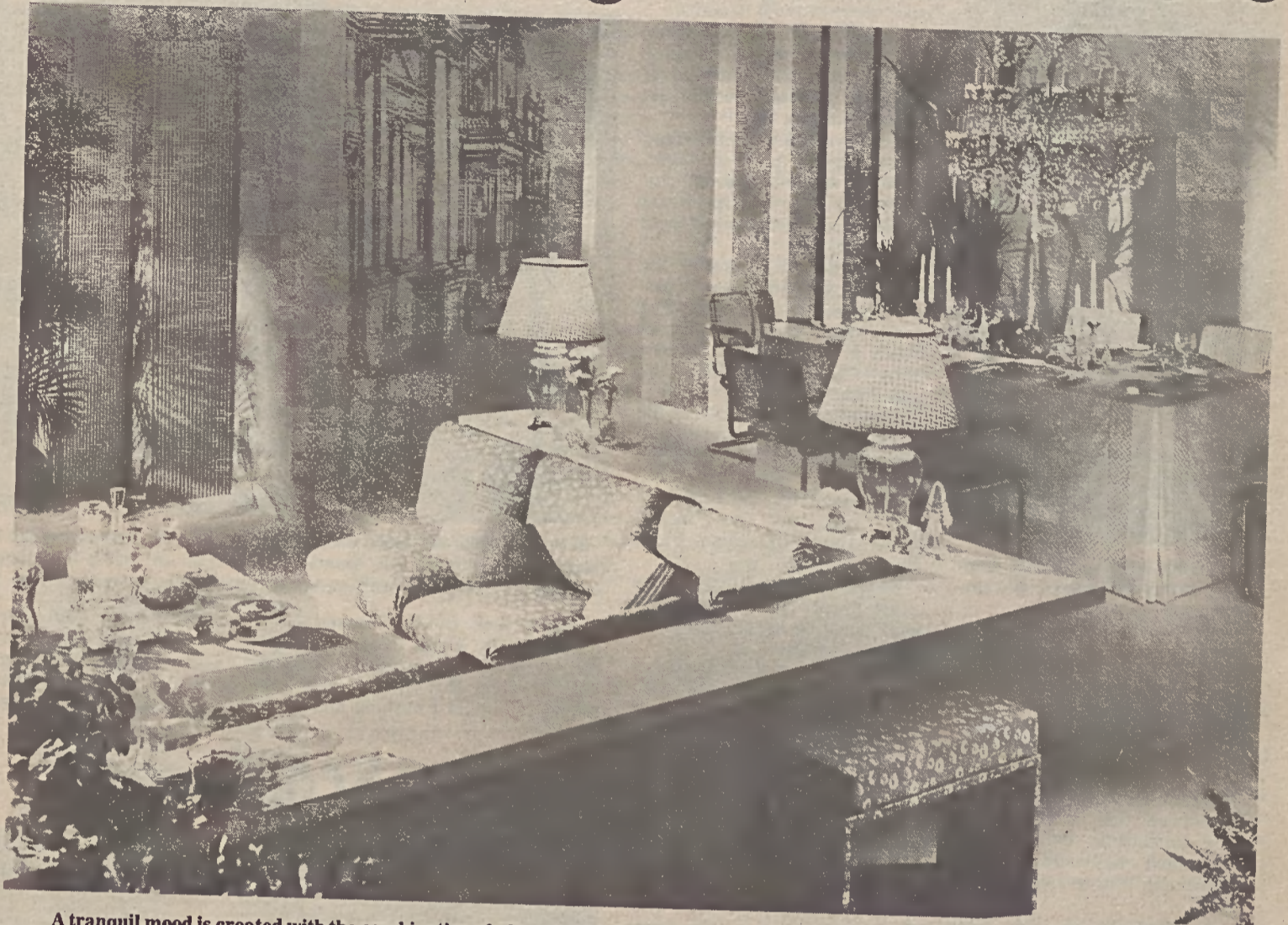
A tranquil mood is created with the combination of "Tranquility Poppy" and "Tranquility Stripe" in this handsome living-dining area.

in the house. The program will consist of separating demonstrations, exercise (yoga) routines, tips on maintaining and ways to create different moods with music and lighting. The national ad campaign, beginning in April, will showcase the design and color variety of each component in the "Mixed Emotions" collection. The ad campaign schedule will be featured in the following issue.