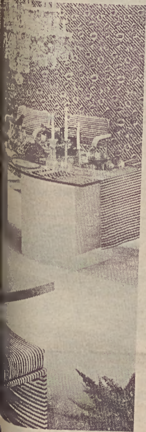
the new Missoni collection