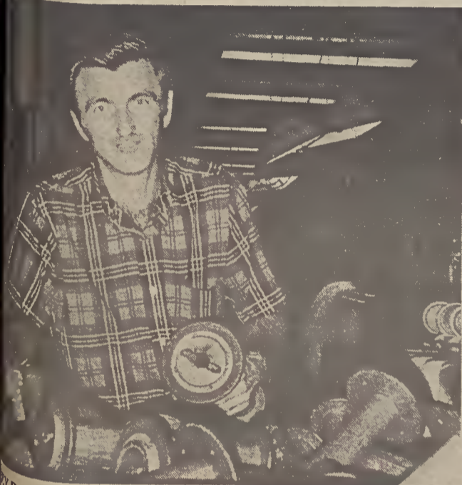
YARN MAN, Twist, Wind, Reel Department.