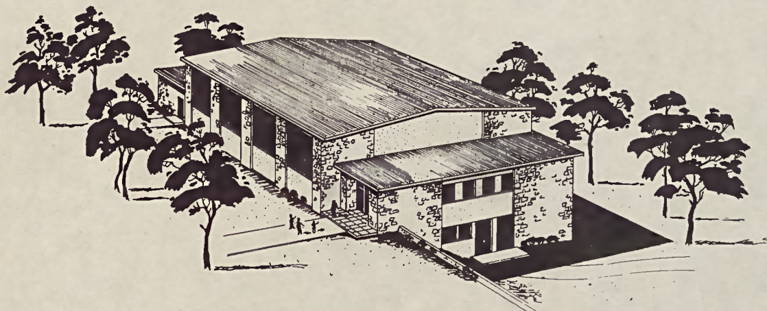
PROPOSED GYMNASIUM - MONTREAT, N.C.

DEBBE, HOLLAND & RIVIERA ARCHITECTS & ENGINEERS SALBY, N.C.