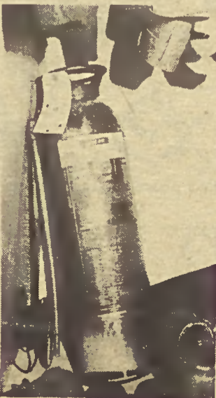
"Extinguishers now unaccessible"

M-AC he replied, "No, because the college is outside of the fire zone." This technicality could cost a life and valuable property damage. If the administration realizes its mistake and voluntarily places the fire extinguishers in their proper places, it may be after a disastrous fire.