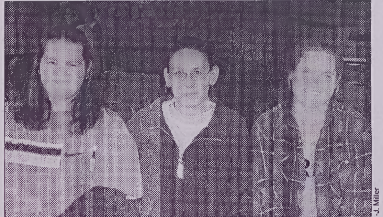
Some of our Montreat ladies waiting for their chance to help put an end to the Carolina Blood Shortage.