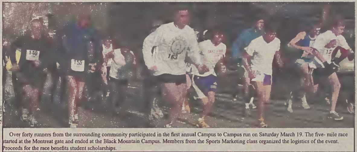
Over forty runners from the surrounding community participated in the first annual Campus to Campus run on Saturday March 19. The five-mile race started at the Montreal gate and ended at the Black Mountain Campus. Members from the Sports Marketing class organized the logistics of the event. Proceeds for the race benefits student scholarships.