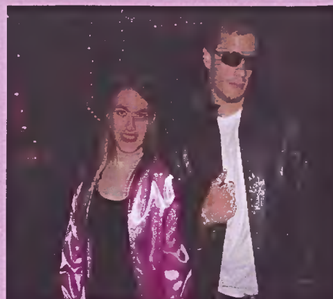
Editors: Past and Present

It's that time again: the first issue of The Whetstone for the year is here! It's in for some big changes this year—for example, you might have noticed that we are offering $5 per accepted article on a trial basis. If we get enough quality articles to continue it, it will become a regular thing, so keep the submissions coming in!