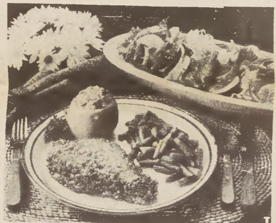
Table salt, chemically sodium chloride, is about 40 percent sodium. While it plays an active role in many important physiological functions, many health professionals believe Americans consume far too much sodium.

In the past year, the U.S. Department of Agriculture and the U.S. Department of Health and Human Services issued joint dietary guidelines advising Americans to "avoid too much sodium." The Senate Select Committee on Nutrition and Human Needs proposed a dietary goal of 5 grams of salt per day, the equivalent of 2 grams of sodium. Americans currently consume 6 to 18 grams of salt per day, much greater than the physiological need.