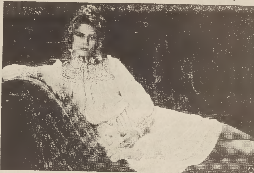
Dresses were never more exciting than they are this season—no matter which way your fancy turns.

Most important for a contemporary miss are the wondrously different looks she can latch on to, offered by leading dress manufacturers. "Today, you want more fashion options," advise experts. "You want your choice of the best possible worlds in Fashionland."