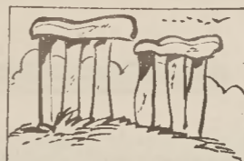
The construction of Stonehenge required an estimated 15 million hours of labor.

If you have arthritis in your hands, get a pair of stretch gloves — like nylon-knit or Spandex and nylon. Wear them every night while you sleep. You may notice a big improvement.