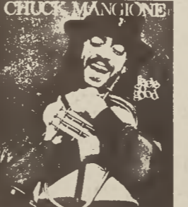
Chuck Mangione; 8/29 The Ramones; 9/3 Bonnie Raitt; 9/8 Adam and the Ants; 9/11 Ian Hunter.