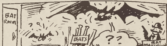
Bats range in size from a wingspan of over five feet to one of under two inches.